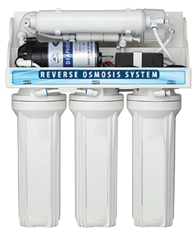
Booster Pump Model: RO75BP