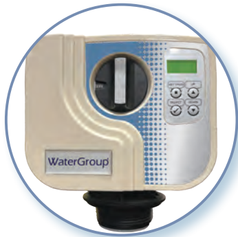
WG 665 Valve