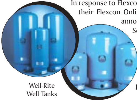
Well-Rite Well Tanks

In response to Flexcon's announcement regarding the discontinuation of their Flexcon Online Well Tank Series, WaterGroup is pleased to announce the addition of the Well-Rite Well Tank Series including Well-Rite Online Well Tanks. Additionally, we are adding the Flexcon FL – Flexlite Fiberglass Well Tanks. These tank series joins our current AquaFlo Well Tank line and our Flexcon Heating & Thermal Expansion tank line to provide you with a complete offering of tanks for multiple applications.