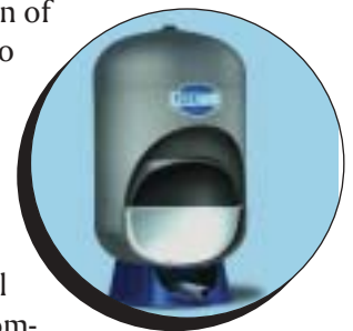
Flexlite Fiberglass Well Tanks

In response to Flexcon's announcement regarding the discontinuation of their Flexcon Online Well Tank Series, WaterGroup is pleased to announce the addition of the Well-Rite Well Tank Series including Well-Rite Online Well Tanks. Additionally, we are adding the Flexcon FL – Flexlite Fiberglass Well Tanks. These tank series joins our current AquaFlo Well Tank line and our Flexcon Heating & Thermal Expansion tank line to provide you with a complete offering of tanks for multiple applications.