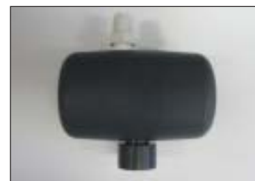
Item Number: 33354 HYDROCHARGER, ASSY, 1" FNPT, ADJUSTABLE, PVC

This is a running change as the inventory of units with brass hydrochargers is exhausted units with the PVC hydrocharger will be sent. A label has been added to the outside of the carton of the Chemical Free units. This label will identify the units built with PVC Hydrochargers.