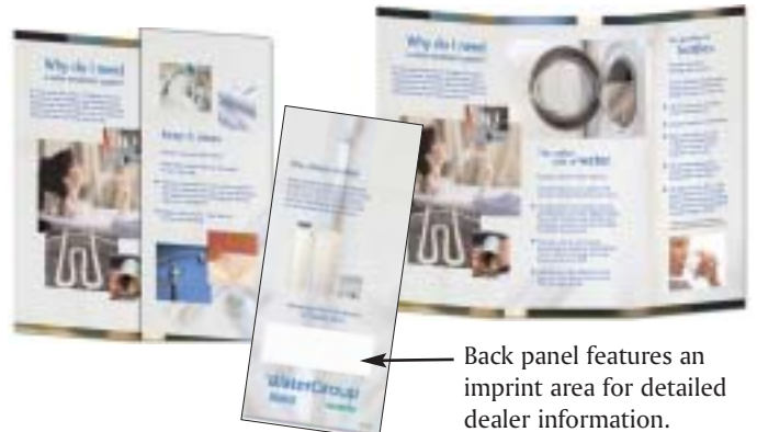
Back panel features an imprint area for detailed dealer information.

Call 1-877-288-9888 or e-mail customerservicecanada@watergroup.com to get your free literature today!