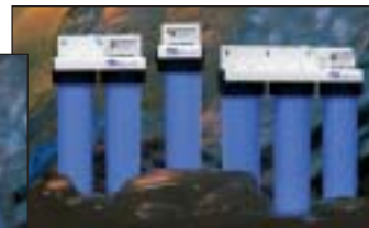
UV Big Boy™ Series