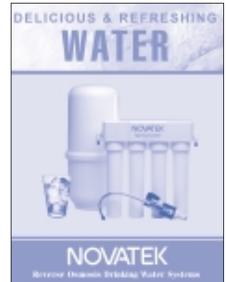
#57134 (full color) Reverse Osmosis Brochure