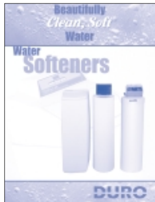
#57520 (full color) Softener Brochure