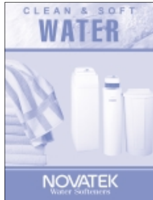
#57253 (full color) Softener Brochure