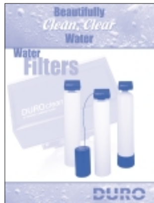
#57519 (full color) Filter Brochure

We have been updating our literature to provide you, our customers, with more attractive, full color pieces that show all the benefits of our products.