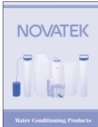
#57556 Product Catalog

The following updated literature is now available: