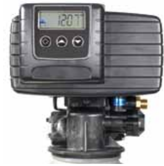
5600SXT Electronic Control with large backlit display and user-friendly programming

* Depends on inlet water chemistry. Frequent backwashing and use of Resin Cleaner may be required. This softener is not recommended for iron bacteria or organically bound iron.