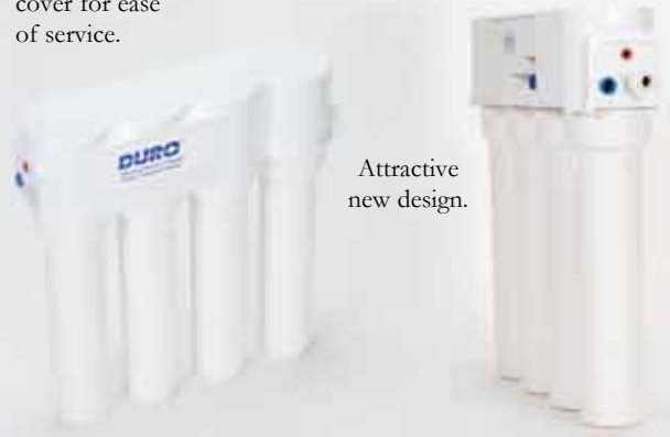
Attractive new design.

New slim profile with integrated mounting bracket for easy, space saving installation.